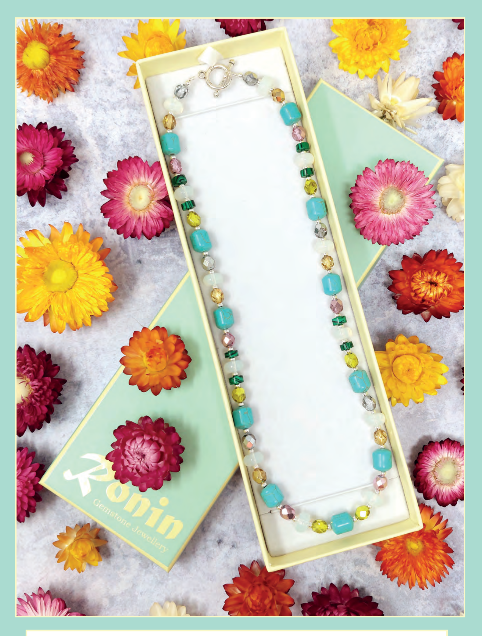
All of our jewellery is supplied gift boxed and presented with our own branded tissue paper